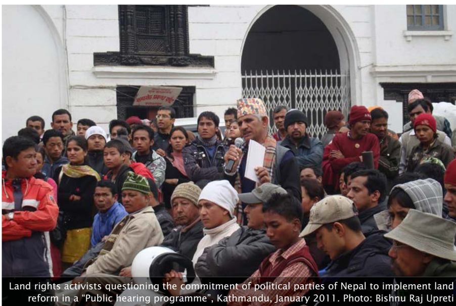
Land rights activists questioning the commitment of political parties of Nepal to implement land reform in a "Public hearing programme", Kathmandu, January 2011.

Land governance. A combination of rules, institutions, and procedures related to the management and utilisation of land resources. Ideally, these are transparent, participatory, and inclusive, and address issues such as improving productivity, ensuring equity and social justice, dealing with political power relations, and enhancing the livelihoods of poor, marginalised, and land-dependent people. It also includes the management of land disputes, land use planning, legal and regulatory provisions, transparent taxation, and a comprehensive land information system.