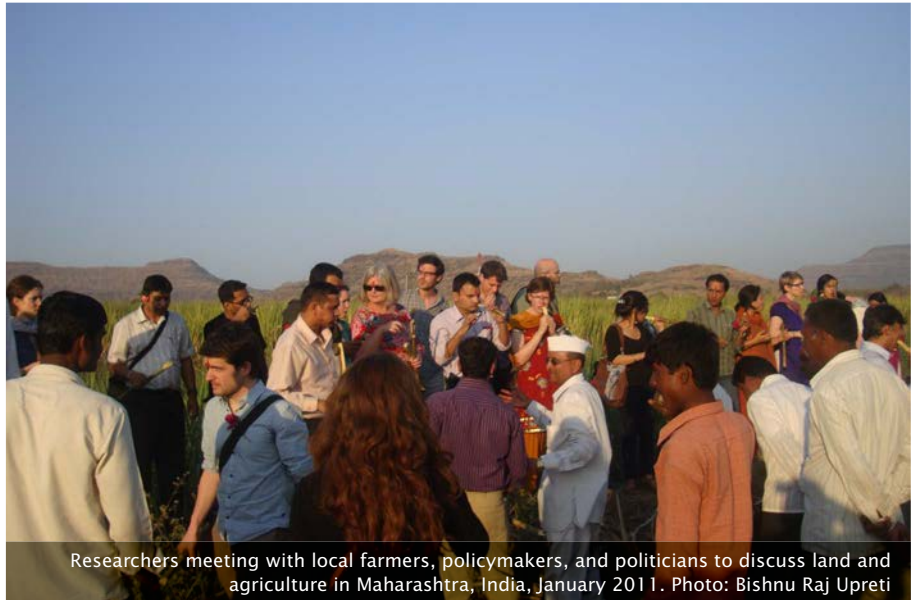
Researchers meeting with local farmers, policymakers, and politicians to discuss land and agriculture in Maharashtra, India, January 2011.

Such a model would not work without the full commitment of political decision makers and governments, and a conducive policy environment with responsive legal and institutional arrangements. If these conditions are fulfilled by South Asian governments, a transformative model would address the weaknesses and incorporate the strengths of redistributive land reform (often advocated by pro-poor land reform activists) and productivity-oriented reform (which emphasises enhancing productivity).