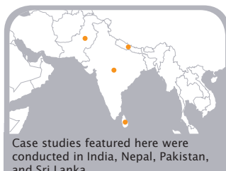
Case studies featured here were conducted in India, Nepal, Pakistan, and Sri Lanka.