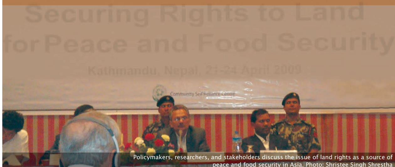
Policy makers, researchers, and stakeholders discuss the issue of land rights as a source of peace and food security in Asia.